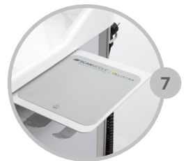
7 Silicone mouse pad