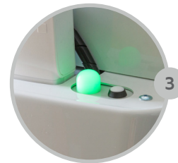
3 LED indicator at the back for battery level and On-Off button for safe shutdown