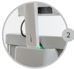
2 Height adjustable arm for screen