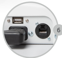
6 USB + UTP connections