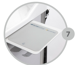
7 Silicone mouse pad