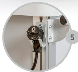
5 Holder for power cord