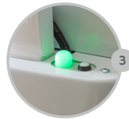
3 LED indicator at the back for battery level and On-Off button for safe shutdown